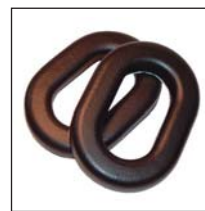
Replacement ear cushions