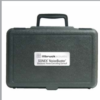
Carrying case with foam insert