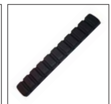
Self-stick supplemental headband cushion