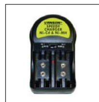
Speedy battery charger